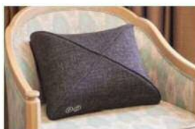
Massage Cussion "Rurudo"

Your skin will refresh by Nanocare. Platinum Steam ensures a fine skin. Enjoy self estetic in the room.