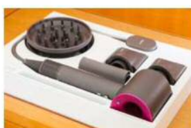
Dyson Hair Dryer

High air pressure h faster hair dry, and avoids hair damage from excessive heat.